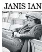
Society's Child an autobiography